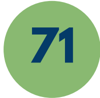
Total Number of Assessors