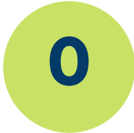
Total Number of Assessors Added