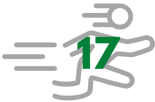
Total RRH: 199